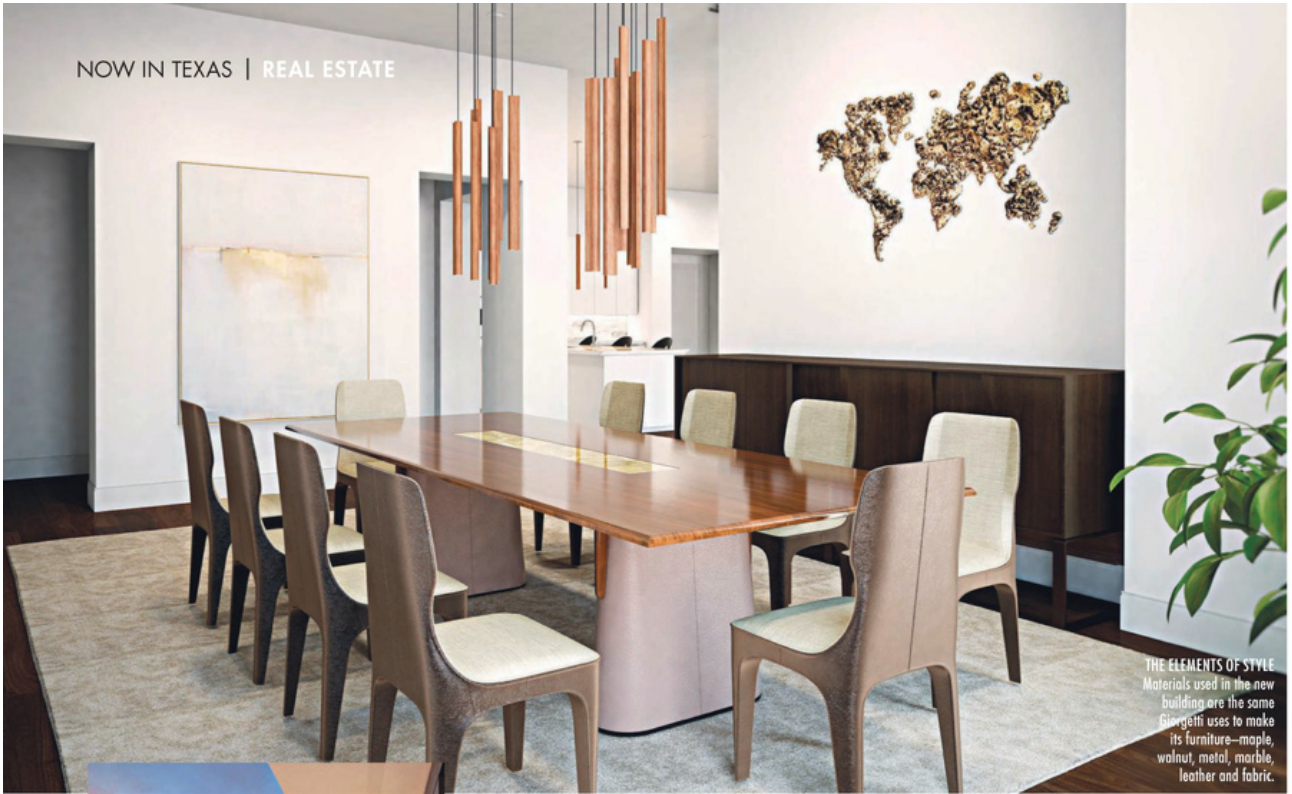
THE ELEMENTS OF STYLE Materials used in the new building are the same Giorgetti uses to make its furniture—maple, walnut, metal, marble, leather and fabric.